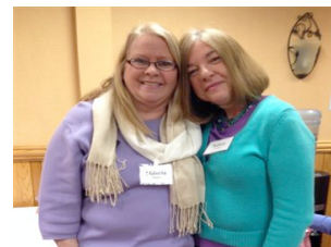
Renewing freindships at the PARID Conference.