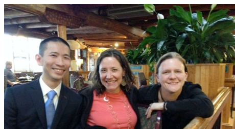
2014 PARID Conference Interpreters

Please visit the PARID website for more information about this position.