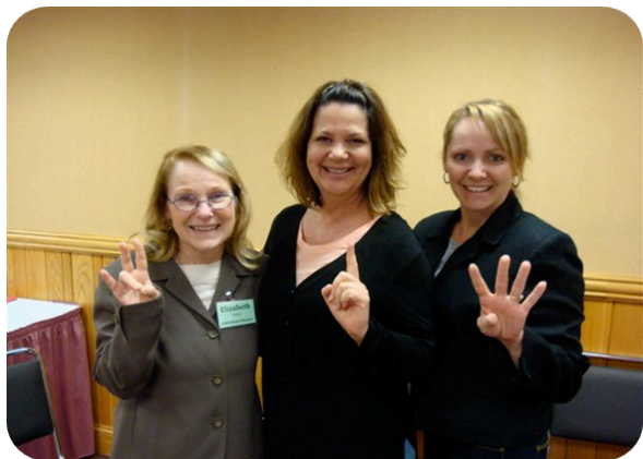
Districts 1, 4, 7

District Members at their Caucus Meetings