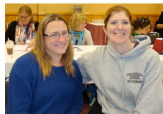
Seminar attendees at the PARID Conference.

What are your thoughts? Please let me know which topics and ideas interest you! Please email me at district8rep@parid.org . I look forward to hearing from you!